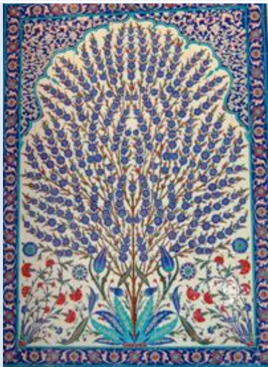
Mosaic tiled niche

Remember we bring new eyes to your home.