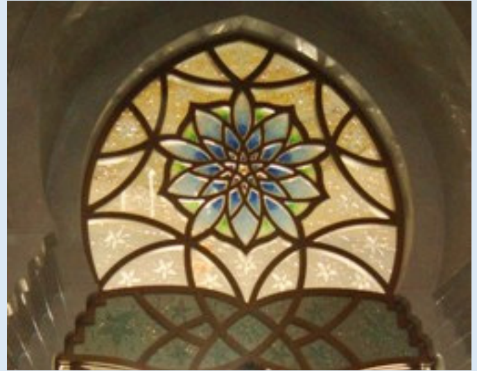
Hand etched crystal window